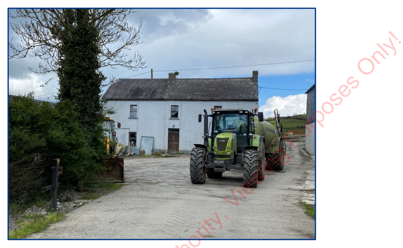
Plate 12.1 Structure 1 looking north