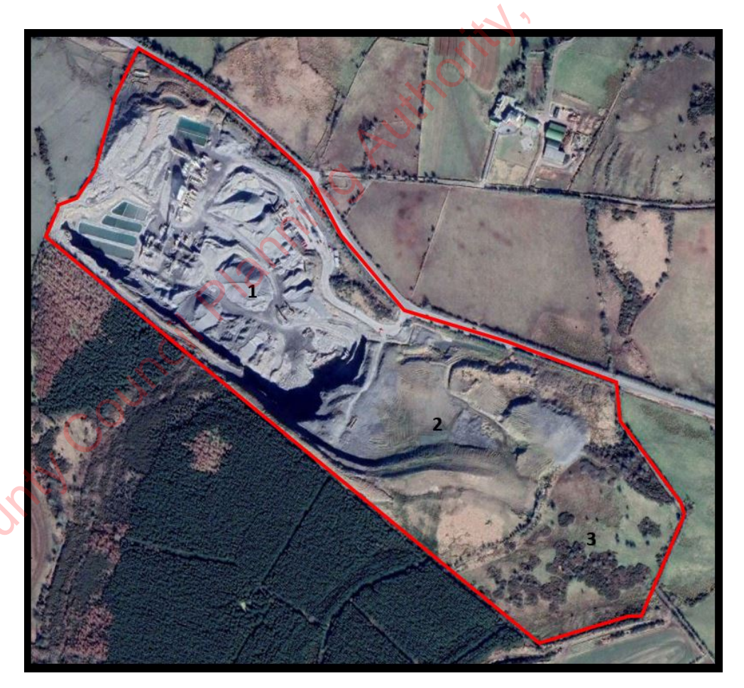
Plate 12.4 The numbered fieldwork areas indicated on a Google Earth 2010 aerial photograph.