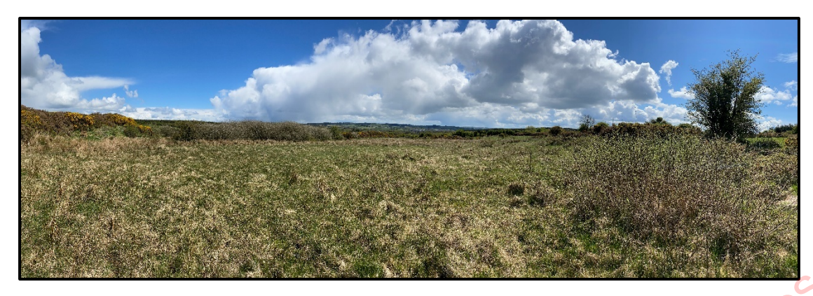
Plate 12.7 Panoramic view of area 3 looking south-east.