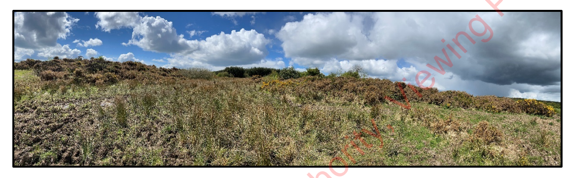
Plate 12.8 Panoramic view of area 3 looking north-west.