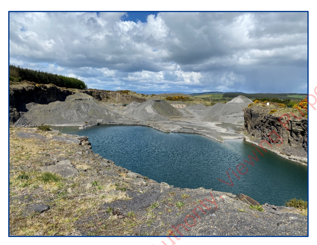
Plate 12.5 View of area 1 looking north-west.