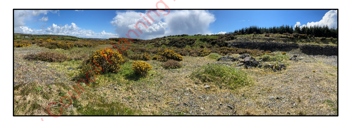
Plate 12.6 Panoramic view of area 2 looking south-east.