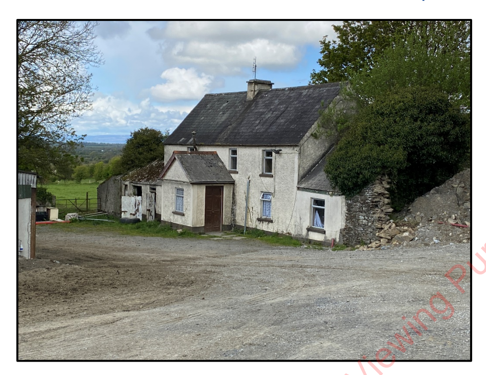
Plate 12.3 Structure 3 looking south-west.